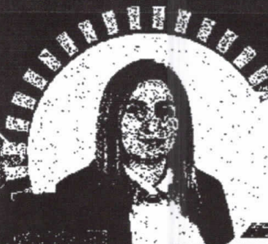
MUTHMAINANCS, POLS. M. PD. MINISTRY OF EDUCATION CULTURE, INDONESIA

THE EFFECTIVENESS OF ICT USAGE IN EDUCATION