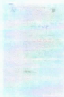
Cover letter001.jpg 784K