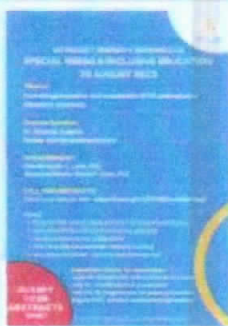
PHILSSET Reserach Conference (1).png 456K