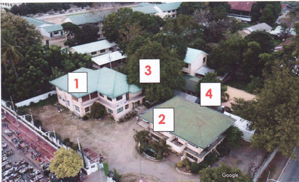
Birds-eye view of DepEd Digos City Division