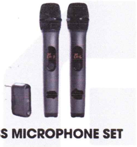
WIRELESS MICROPHONE SET