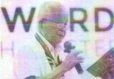
Write about climate change