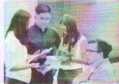
Learn what PH is doing vs. climate change

Learning is a school paper editor of Cebu College (Borromeo) in Cebu.