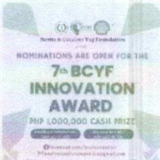
BIA Announcement.png 270K