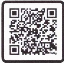
2025 CSC FUN RUN RegLink

Registration shall be done through the online registration form which can be accessed using this https://bit.ly/2025CSCFUNRUN or through the QR code below. Deadline for registration and payment is August 26, 2025.