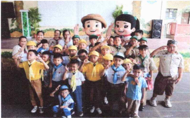
MASCOTS FROM BOYSCOUT OF THE PHILIPPINES