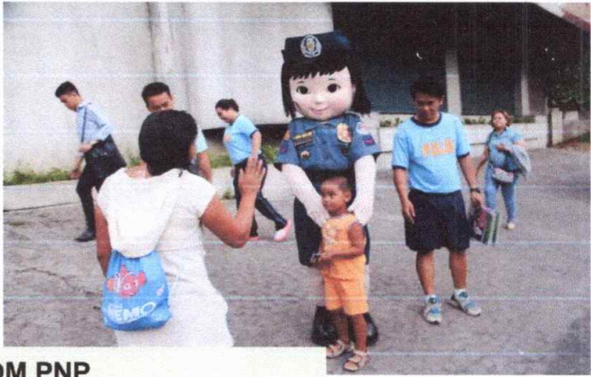
MASCOTS FROM PNP